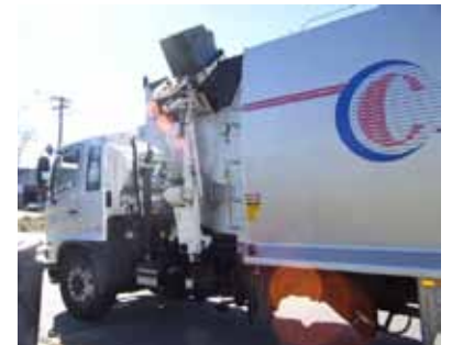
SIDE LIFT LOADERS