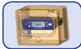
Trailer Chassis Mount