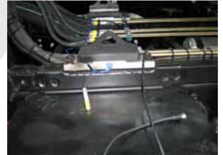
SWEDISH 13" LOADCELL INSTALLED