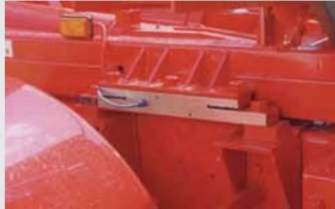
D30945 LOADCELL INSTALLED